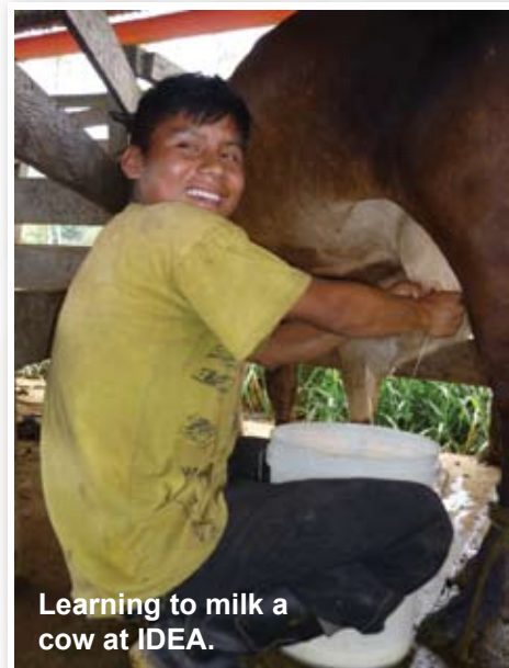
Learning to milk a cow at IDEA.

We are exactly in place for such a time as this with our discipleship program at our model farm. We